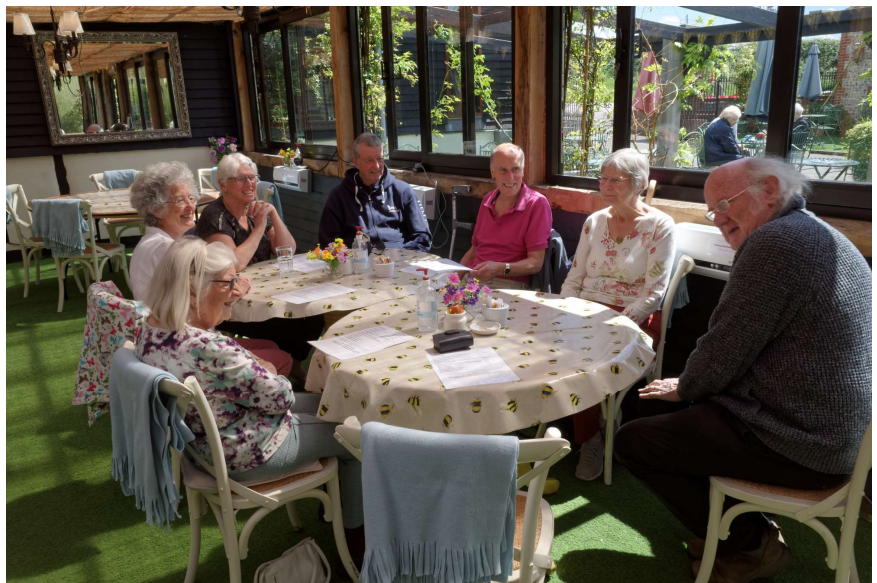
Tea at the Chocolate Frog

Latterly, due to Covid, our meetings have been via Zoom to accommodate some of our vulnerable members and generally this has worked quite well. However, the chance to meet up socially is always fun and we took the opportunity to celebrate a member's birthday by meeting at the Chocolate Frog for a Cream Tea. Our next meeting is in September and the subject chosen is Fine Art.